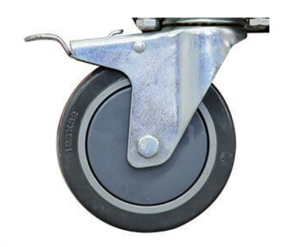
PVC 5" x1.25 fixed castor