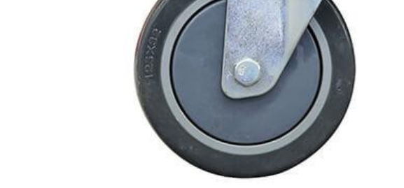
PVC 5" x1.25 fixed castor