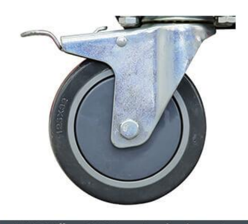
PVC 5" x1.25 fixed castor