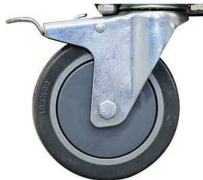
PVC 5" x1.25 swiveled castor