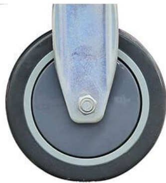
PVC 5" x1.25 fixed castor