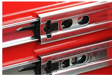
Ball bearing drawer sliders