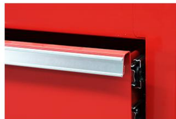
Rolled drawer edges