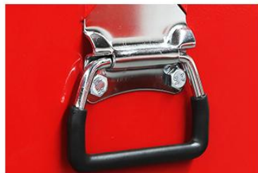
Chrome plate ring handle