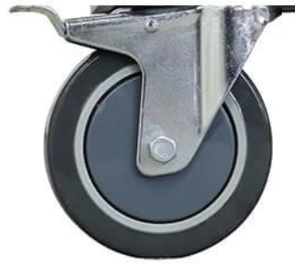
Swiveled castors with brake