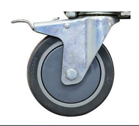
PVC 5" x1.25 swiveled castor